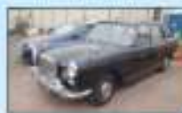
Vanden Plas 1963 £38,500