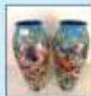
Microsoft Xbox 360