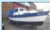
Hardy Motor Boat £10,400