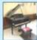
Steinway Grand ES 600