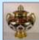
Crown Derby EB91

of Antiques, Collectibles, China & Memorabilia Mid Century, Retro & Vintage Furniture Commercial & Domestic Catering Equipment Office Furniture & Equipment, PCs & Printers Plant, Machinery & Engineering Equipment Woodworking Equipment & Timber Commercial Vehicles & Probate Vehicles Classic Cars, Motorcycles & Boats Insolvency & High Court Enforcement Sales